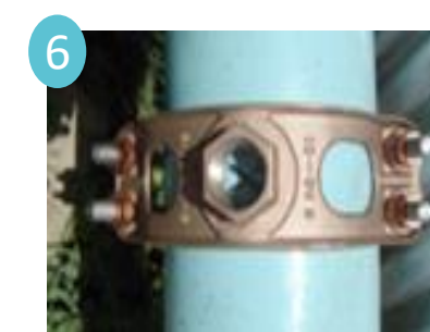
6 Tighten nut(s) evenly per the specifications below until saddle body conforms to pipe.