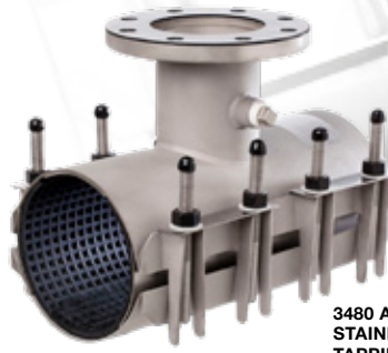
3480 ASMJ/CS-PE STAINLESS STEEL TAPPING SLEEVE W/ FLANGE OUTLET

WASHERS: Stainless Steel per ASTM A240, type 304. Special spring type.