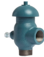
Optional Throttling Device