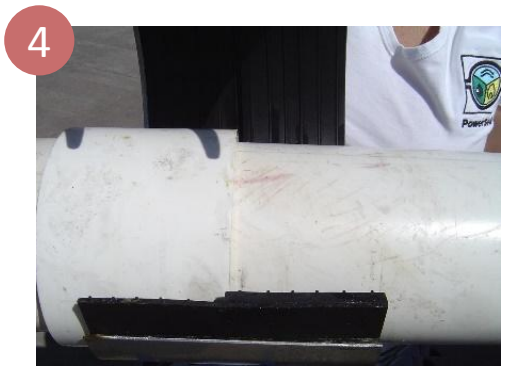
Position the step gasket making sure the thicker part of the gasket goes on the smaller diameter (pipe) and the thinner part goes on the larger diameter (Collar or Bell).

Step 2. Perform steps 3 through 5 again.