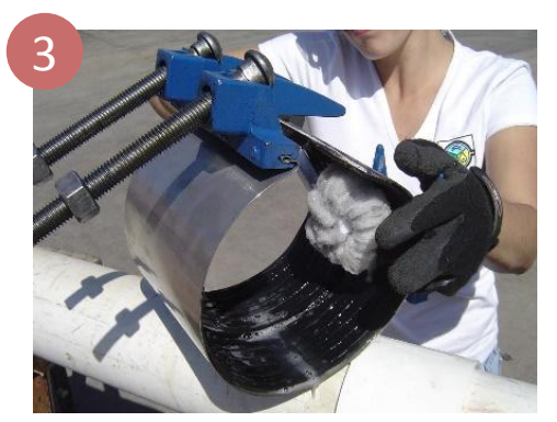
Loosen the nut to the end of the bolt and open the clamp. Do not disassemble. Lubricate pipe and gasket with soap/water solution.