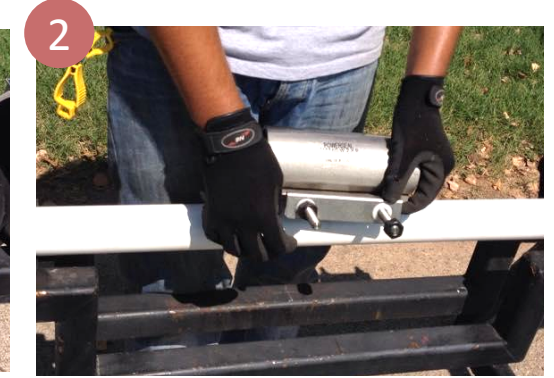
Loosen nuts to the end of the stud bolt, and place the clamp around the pipe centered over the break or damage area with the gasket flap at the top.