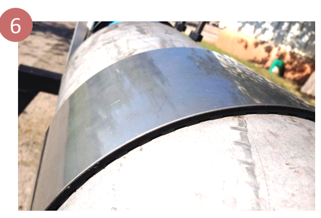
Allow the gasket to fully compress, and recheck the bolt tightness. It is important to re-torque Tapped Repair clamps when used as a "hot tap" saddle after the tap has been made. Torque the bolts as evenly as possible: