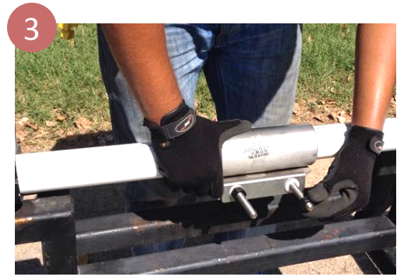
Tuck the gasket flap in place, close the bolt lug, engage the centermost bolt(s) and finger tighten. NOTE: using the palm of your hand, squeeze the end of the clamp fingers and the top of the stud lug to bring stud bolt and fingers parallel.