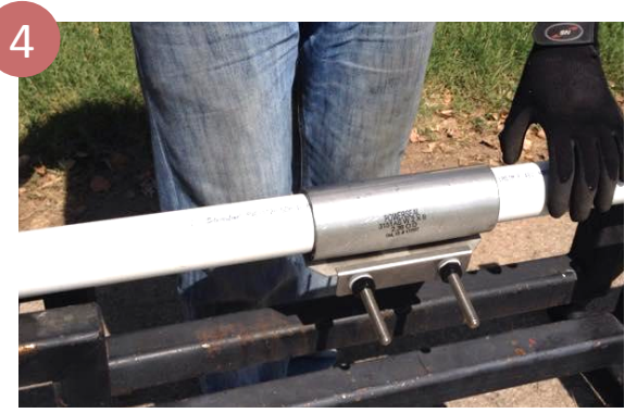
Rotate the clamp to flatten the tapered-end of the gasket, and position the bolts and nuts for convenient tightening. Check the reference mark (if used).

Step 2. Perform steps 3 through 5 again.