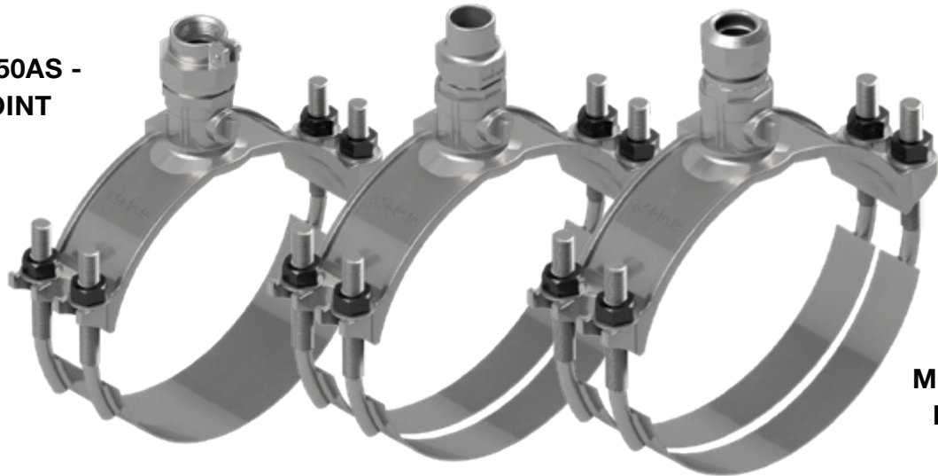
MODEL 3450AS - PACK JOINT