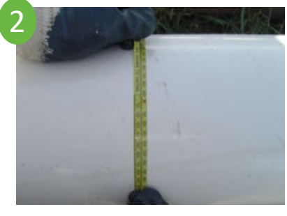
Check the main outside diameter (OD) and confirm that it falls within the tapping sleeve pipe OD range.