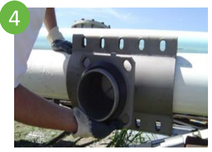
Position flanged (or Mechanical joint) half of sleeve on pipe making sure outlet is properly aligned with branch-line to be connected. Never position so that rotation of sleeve is required.