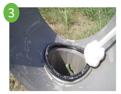
Lubricate pipe, O-Ring or hydro twin gasket with soap/water solution. Do not use grease or pipe lubricant.