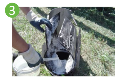
Lubricate pipe and gasket with soap/water solution. Do not use grease or pipe lubricant.