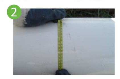
Check the main outside diameter (OD) and confirm that it falls within the tapping sleeve pipe OD range.

Position flanged (or MJ-Mechanical Joint) half of sleeve on pipe making sure outlet is properly aligned with branch-line to be connected. Make certain that the tapered ends of the complete circle gasket are smooth against the pipe. Never position so that rotation of sleeve is required.