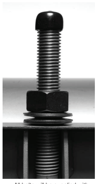
All bolts will be supplied with four spring washer.