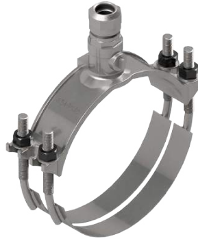
PowerJoint - CTS