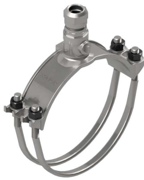
Pack joint - IPS/CTS