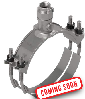
SIDR 7 - Pack joint